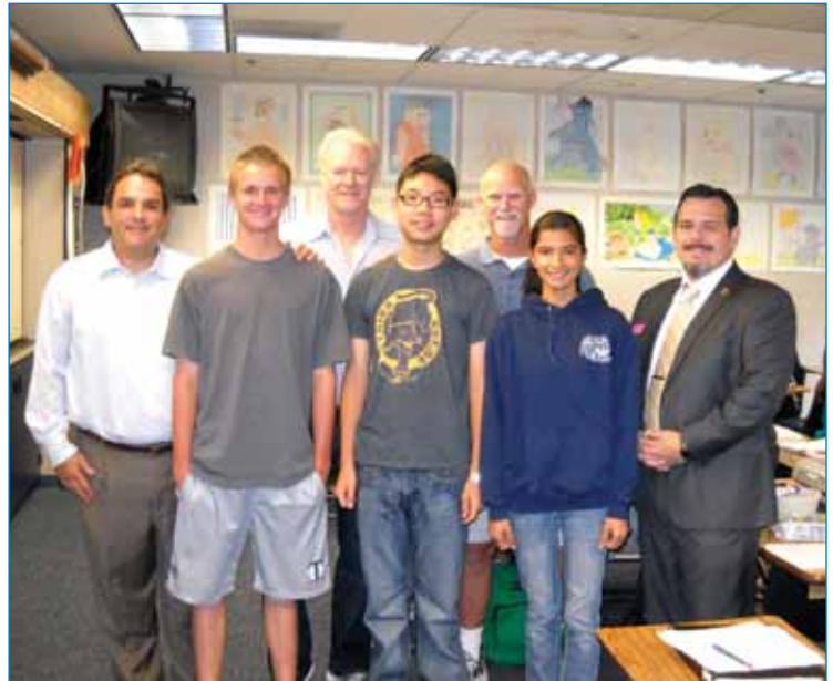
TrigStar Orange County Chapter 2011 Winners

The growing trend is for professional land surveyors to visit high school classrooms to give students (and teachers) a brief overview and history of the profession. This close interaction helps to break the ice and remove the veil of mystery that has obscured land surveying somewhere behind engineering, architecture, and construction. Students are then invited to a local event site, often a community college, to take the Trig-Star test and interact with